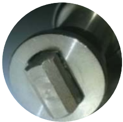
Integral unique locking system for easy side to side and hanging

All specifications are correct at time of print, however they are liable to change and should be confirmed at point of order.